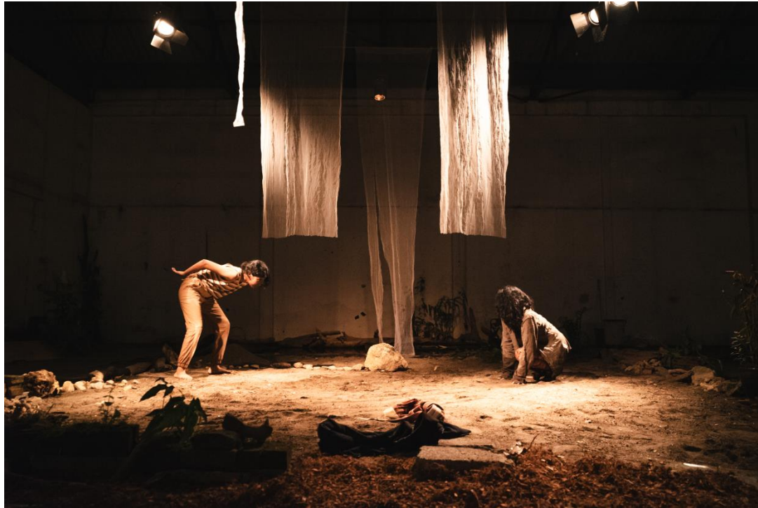
Malaysian Play: Symbiocene